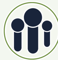
Associates/Staff ( & their spouses, too! )

Spouse eligibility has been included because so many families today depend on the income of both spouses. The eligible member, or employee of a member, does not have to enroll for the spouse to sign up.